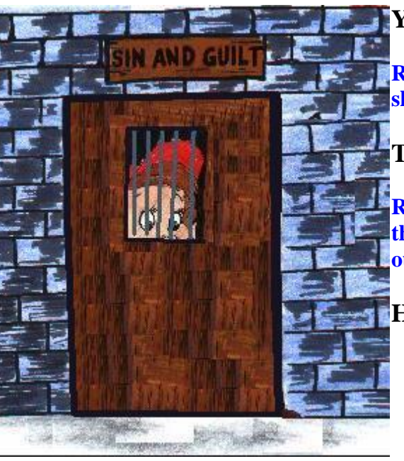
John 3:18 "He that believeth on him is not condemned: but he that believeth not is condemned already, because he hath not believed in the name of the only begotten Son of God"

You are on your way to hell already, because you have not believed in the name of the only begotten Son of God.